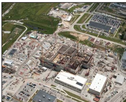
MOX Fuel Fabrication Facility