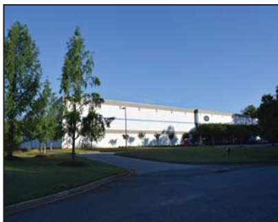
Sally Beauty Supply