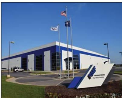
Roy Metal Finishing