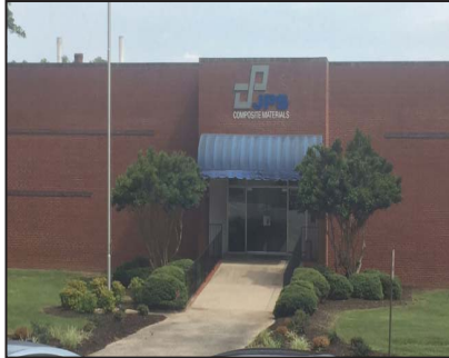
JPS Composite Materials