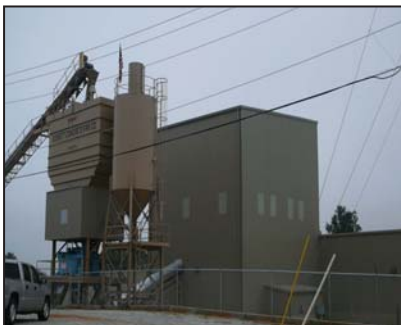
Gossett Concrete Pipe